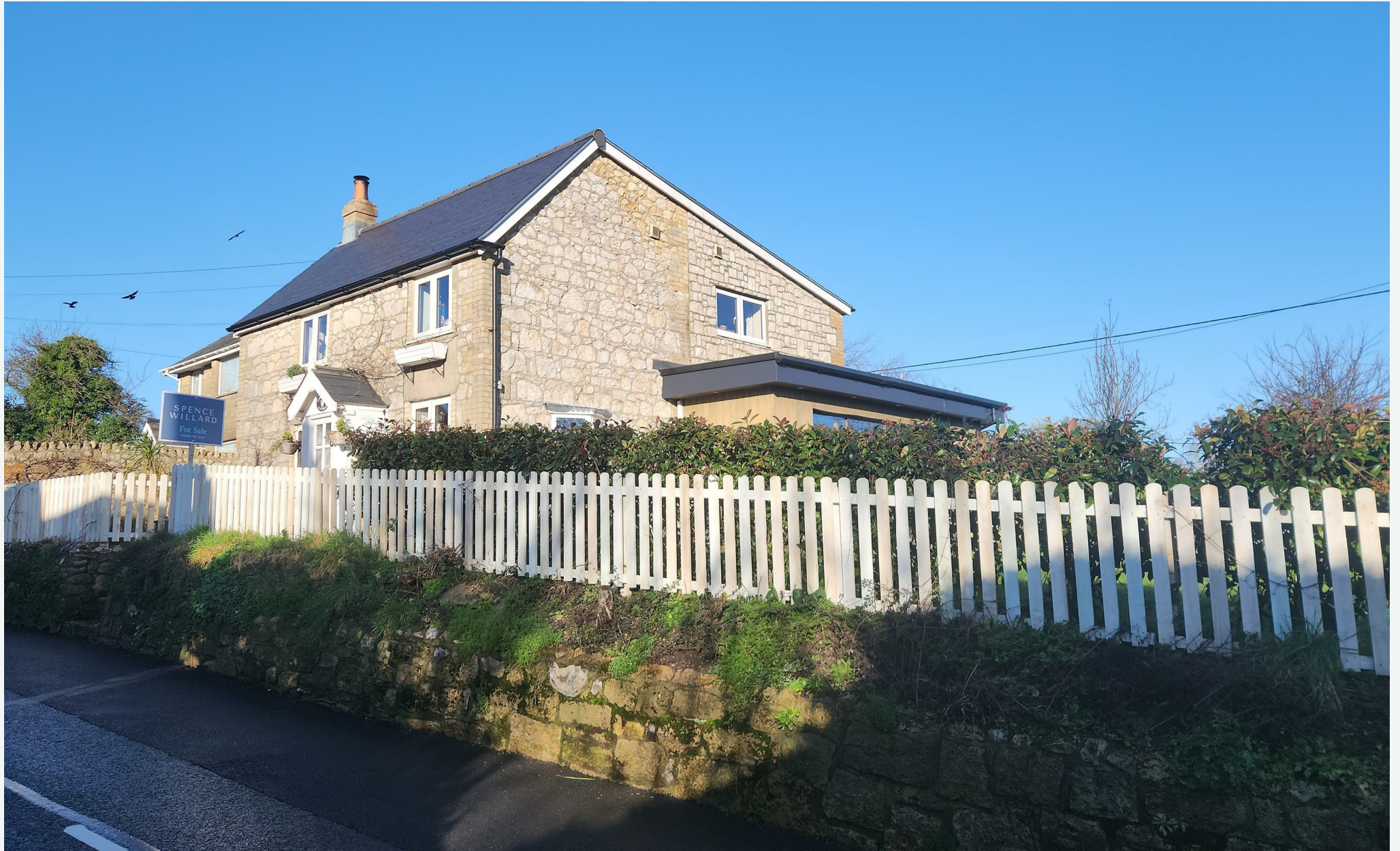
Lavender Cottage, Newbridge, Isle of Wight